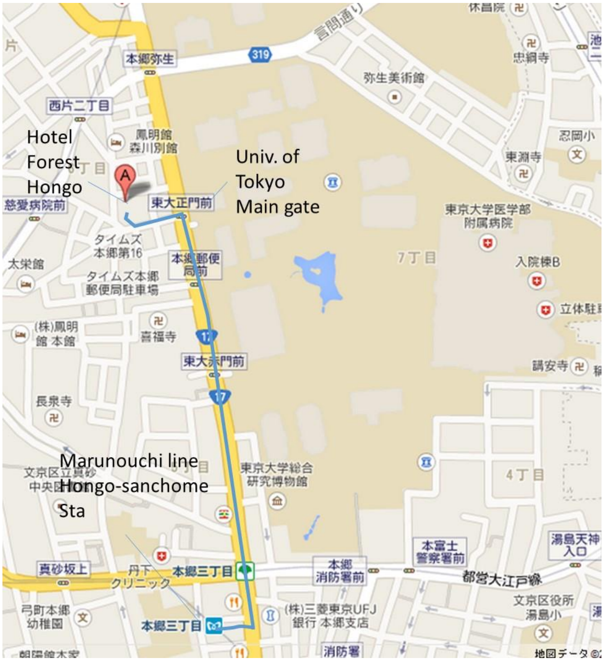
Google Map < Forest Hongo-Marunouchi line Hongo-sancho>